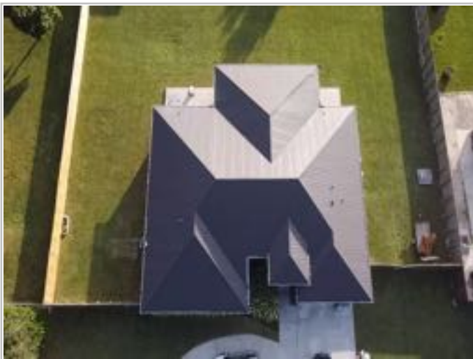
Roof Angle 1