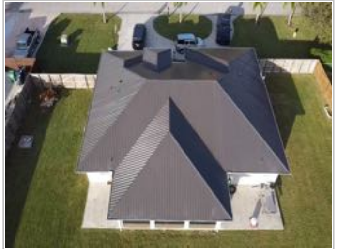
Roof Angle 6