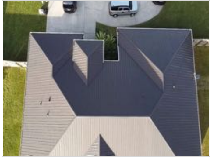
Roof Angle 4