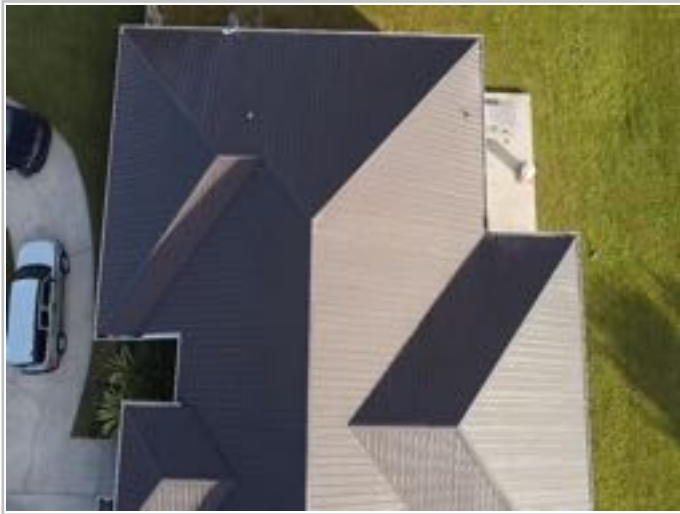
Roof Angle 5