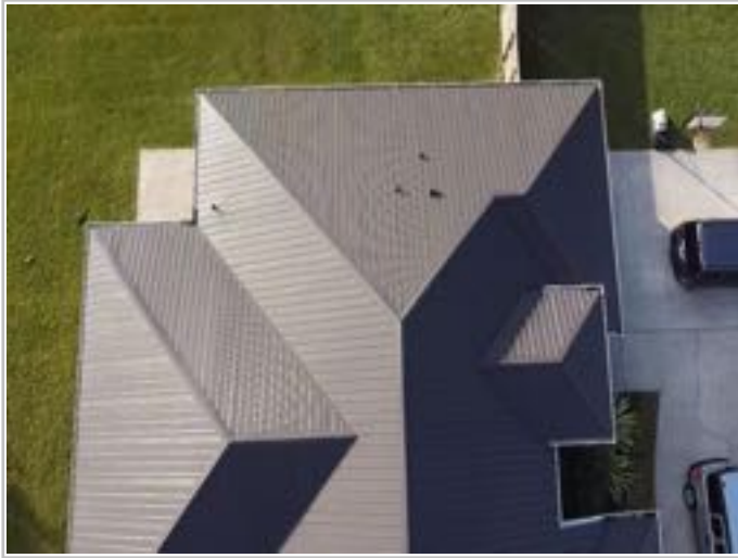
Roof Angle 3